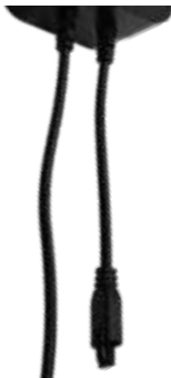
IR Receiver (on adapter housing)