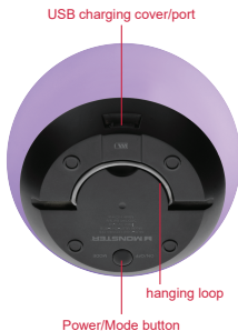
LED Mini Orb (bottom)